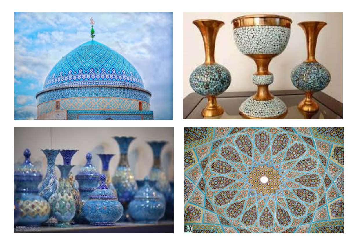
Picture 1 – Appearance of turquoise stone and blue color in Iranian culture

(2015:63), based on the book "Jauharname Nezami" (XII century) written by Iranian jeweler Mohammed bin Abul-Barakat Jauhari Nishapuri, says that turquoise was mined in four regions of the world (Khorasan, Khorezm, Maurenahr and Turkestan, where the Turkic tribes lived). Jewelers and carpenters immediately recognized the origin of the turquoise stone, because they differed in quality and color. According to European jewelers, the highest quality turquoise is made in Iran. The most valuable types of this stone called 'Abu Ishaq' or 'Soleimani' were mined in Nishapur.